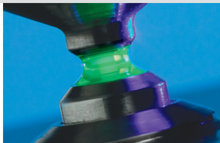
NanoDrop 3300 patented retention system

As the industry leader in micro-sample quantitation, Thermo Scientific NanoDrop products meet the needs of today's laboratory scientist with instruments that are smart, simple and robust. We combine our extensive expertise in micro-sample analysis with an in-depth understanding of real-life applications to deliver the latest in UV-Vis and Fluorescence instrumentation.